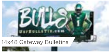
14x48 Gateway Bulletins