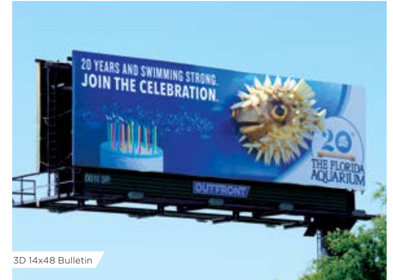
3D 14x48 Bulletin