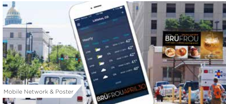
Mobile Network & Poster

We are OUTFRONT Media. Always innovating. Always connecting. Always on. Always the right choice. Always.