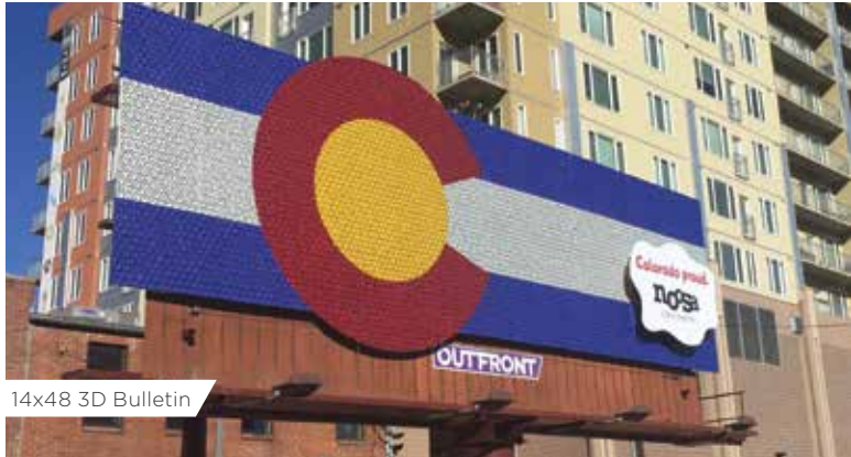
14x48 3D Bulletin